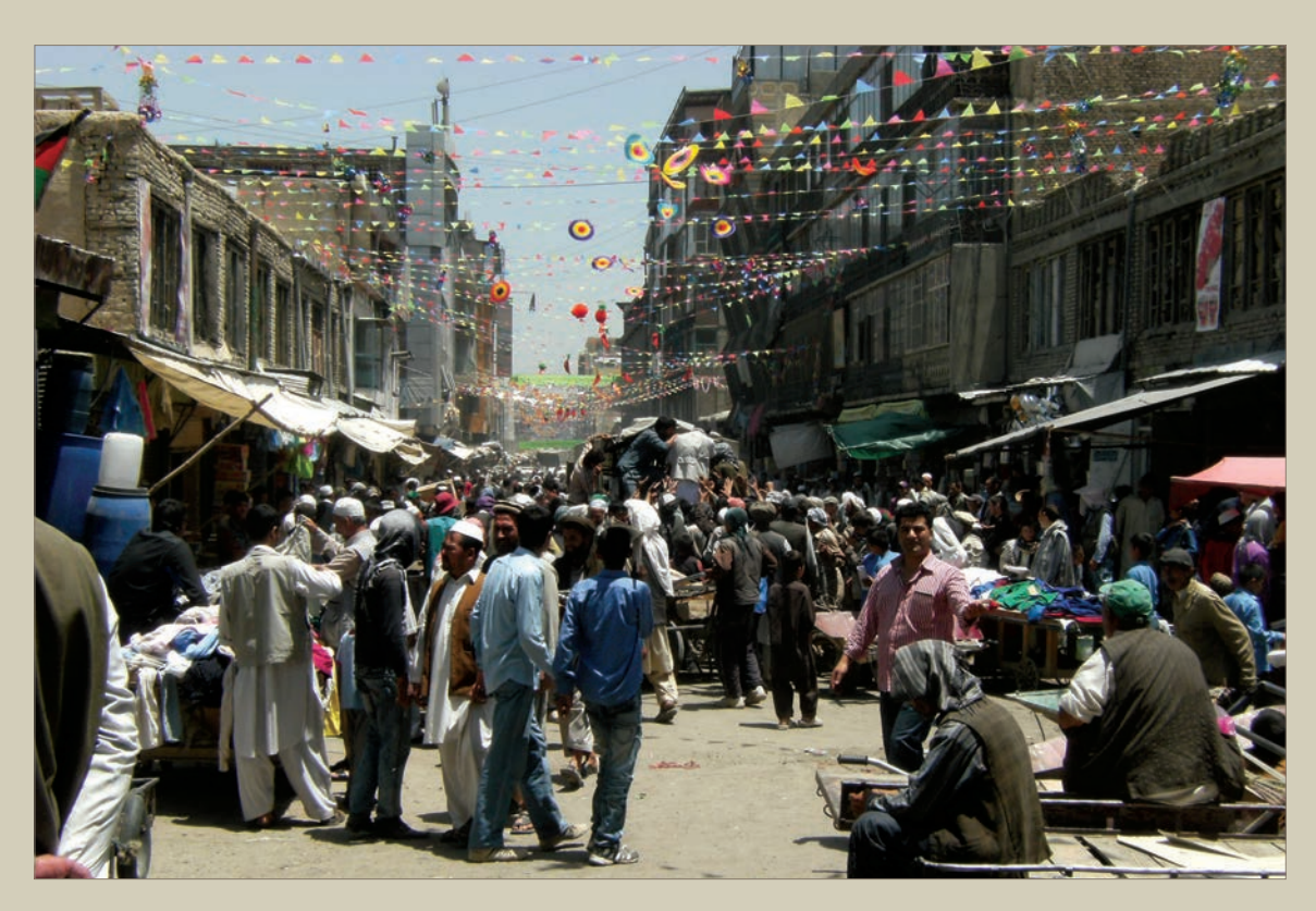
Afghans shopping, getting food, chatting, and resting in Kabul's busy Mandawi Market.