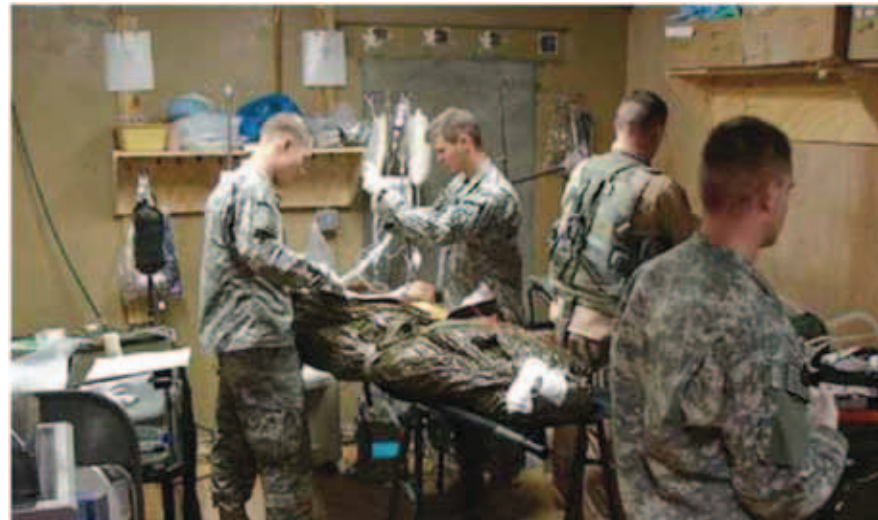
Figure 8: Damage control resuscitation

This pursues the best combination and optimal use of alternatives to whole blood (e.g., plasma, red blood cells, blood-clotting agents) to prevent bleeding and maintain oxygen delivery and nutrients to tissue. These products will likely enhance survival of casualties after severe blood loss, which is the leading cause of death to injured Warfighters. Recent data from the battlefield suggests that blood-clotting disorders and immune system activation, which damage normal cellular metabolic processes, commonly occur in severely injured patients. Therefore, a priority is to maintain blood-clotting capability and oxygen and nutrient delivery to tissues by using the best resuscitation products that can be administered at far-forward locations.