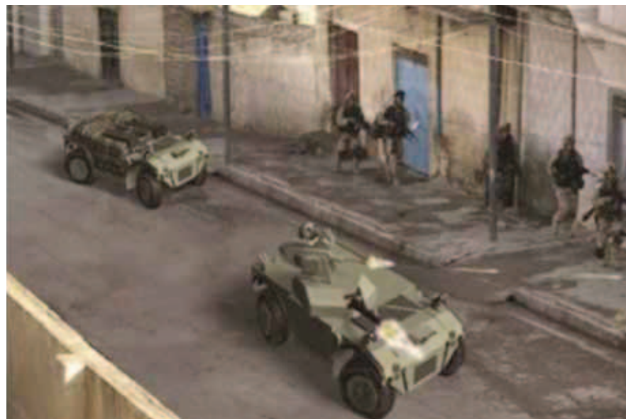
Figure 9: Safe operation of unmanned systems for reconnaissance in complex environments

This effort develops, integrates, and demonstrates robust robotic technologies required for Future Modular Force unmanned systems. This technology will advance the state-of-the-art in perception and control technologies to permit unmanned systems to autonomously conduct missions in populated, dynamic urban environments while adapting to changing conditions; develop initial tactical/mission behavior technologies to enable a group of heterogeneous unmanned systems to maneuver in collaboration with mounted and dismounted forces; optimize Soldier operation of unmanned systems; and provide improved situational awareness for enhanced survivability. Modeling and simulation will be used to develop, test, and evaluate the unmanned systems technologies (e.g., tactical behaviors and perception algorithms). Test bed platforms will be integrated with the software and associated hardware developed under this program, as well as appropriate mission modules, to support Warfighter experiments in a militarily significant environment.