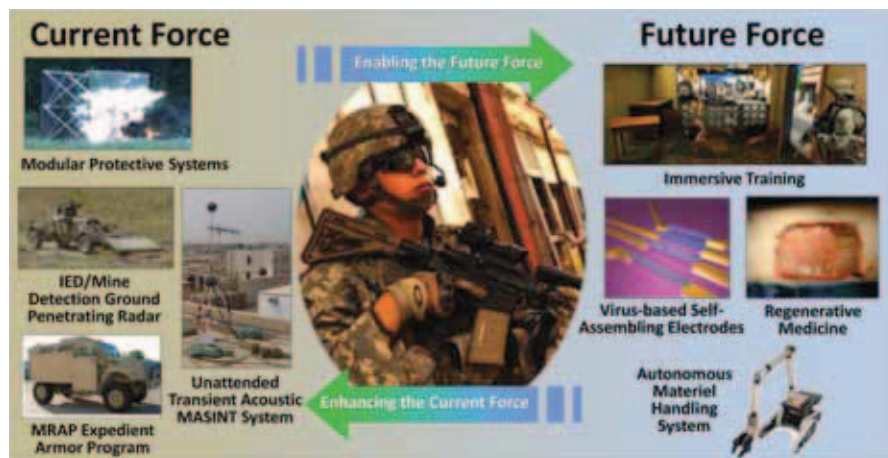
Figure 1: Army S&T Strategy—Develop and mature technology to enable the Future Force while seeking to enhance the Current Force

The Army Science and Technology (S&T) strategy supports the Army’s goals to restore balance between current and future demands by providing new technologies to enhance and modernize systems in the Current Force and to enable new capabilities in the Future Force. This strategy is enabled through a portfolio of investments, each providing different results in distinct timeframes.