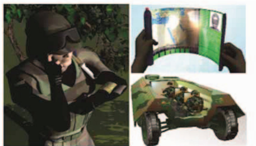
Figure 4: Flexible display technology for Soldiers and vehicles

The flexible display initiative develops flexible display technologies for affordable, lightweight, rugged, low-power, and reduced-volume displays in conjunction with the development of human factors parameters for systems utilizing flexible displays. Flexible displays have reduced weight and are inherently rugged with ultra-low power electro-optic technologies as compared to traditional liquid-crystal, glass-based displays. The development of displays on flexible substrates will enable novel applications that cannot be achieved by glass-based technologies (e.g., wearable and conformal for Soldier applications, conformal for vehicle and cockpit applications, and compact display that can be rolled out for multiuser applications).