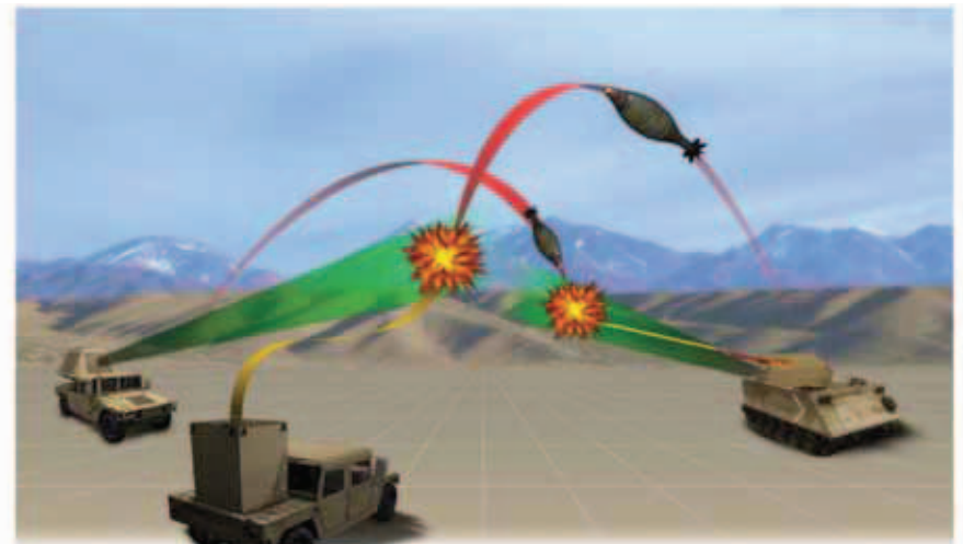
Figure 3: Defense against RAM

Technology efforts in defense against RAM mature and demonstrate critical technologies to provide the mobile capability to defeat threats at extended ranges and across a 360-degree hemisphere. Technologies of missile and gun-launched interceptors to protect against RAM threats include the following subsystems developments: technical fire control node to process the decision logic for intercept; tracking and fire control radar to provide a precise location of the threat; launch systems; a guided missile-based interceptor with a high-explosive warhead; a miniature hit-to-kill missile-based interceptor; and a guided 50mm course-corrected projectile and gun.