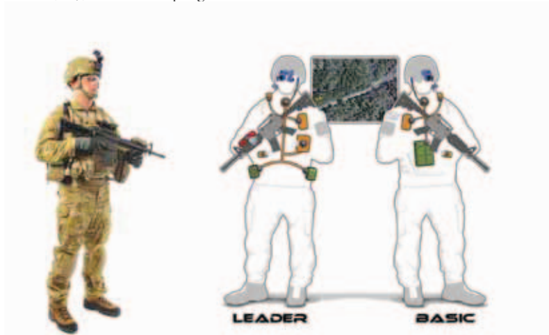
Figure 10: SPINE

This initiative develops a government-owned, Soldier-borne electronic equipment architecture that incorporates a National Security Agency-approved wireless personal area network subsystem. The Soldier Planning Interfaces and Networked Electronics (SPINE) reduces the Soldier-borne footprint and electronics system weight by 30 percent through the loss of wires and connectors. The wireless network will be powered by a conformal battery currently under development that increases power by 50 percent for a 24-hour period. This technology utilizes emerging software services to enable Soldier connectivity and data exchange to current and future tactical radio networks and battle command systems. Throughout this effort, capability demonstrations are conducted at the Command, Control, Communications, Computers, Intelligence, Surveillance, and Reconnaissance On-The-Move test bed at Ft. Dix, NJ, to monitor progress.