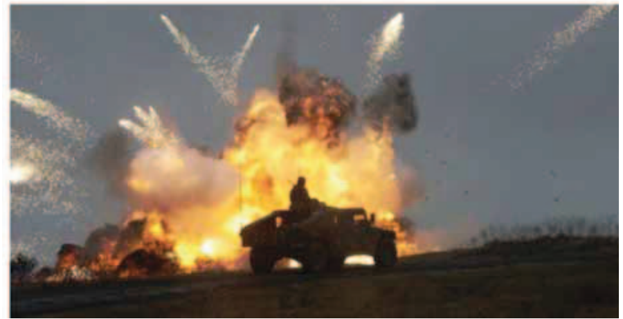
Figure 7: Detection and treatment of TBI

This technology is testing a candidate drug to treat TBI to determine its safety and effectiveness in 200 human subjects that have suffered TBI. It is estimated that 15 to 25 percent of all injuries in recent conflicts are to the head. TBI survivors often have physical and cognitive impairment, memory loss, and mood and personality disorders. There are currently no drugs to treat or reduce brain-related injuries.