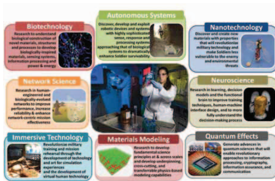
Figure 13: Basic research investments

Basic research investments are a critical hedge in acquiring new knowledge in areas that hold great promise in advancing new and technically challenging Army capabilities and concepts to enable revolutionary advances and paradigm-shifting future operational capabilities. Areas of emerging interest and focus in basic research are autonomous systems, biotechnology, immersive technology, materials modeling, nanotechnology, network science, neuroscience, and quantum effects. Investment in basic research within the Army provides insurance against an uncertain future and guards against technological surprise. And if we are successful, these investments will make it possible to conduct ever more complex military operations, with greater speed and precision, to devastate any adversary on any battlefield. The following is a brief summary of the areas of investment, the synergy among them, and some of the capabilities they may provide.