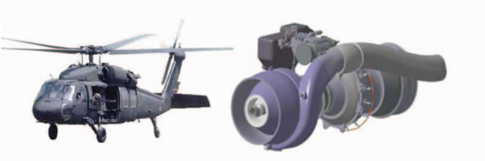
Figure 12: Advanced affordable engine technology

The objective of the Transformational Vehicle Management System is to allow Soldiers to conduct safe aviation missions in high task-loaded environments and in urban/complex terrain conditions by exploiting Full Authority Control Systems and active control technologies in legacy upgrades and new platform configuration. This effort will result in handling quality requirements and integrated control system concepts for legacy upgrades, multirole, and heavy-lift. It will provide simulation and control methods and tools for evolving manned and unmanned aerial vehicle (UAV) rotorcraft configurations, as well as Guidance-Navigation-Control technologies for Autonomous Flight Operations in urban and/or teaming environments. Potential benefits include reduced pilot workload and improved mission task performance for all-weather multimission operations; reduced development costs and design-cycle time; and technologies for UAV rotorcraft urban operations and teaming.