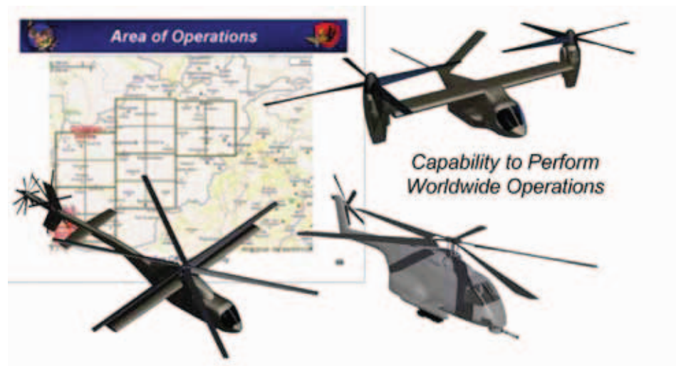
Figure 11: Advanced rotary wing vehicle technology

This effort develops and demonstrates transformational vertical lift technology-enabled capabilities for the next generation of joint rotorcraft, addressing operational capability gaps for aviation along with reduced cost of ownership. This effort will result in a flying Technology Demonstrator that provides enhanced operational efficiencies, such as reduced fuel burn rates, more responsive (faster) operating speeds, extended unrefueled range (longer reach), and increased high/hot time-on-target. It will provide enhanced platform survivability with reduced signatures and increased ballistic protection. Benefits to the Soldier include increased range and on-station time to deliver troops, weapons, and sensors on target, and increased Soldier survivability.