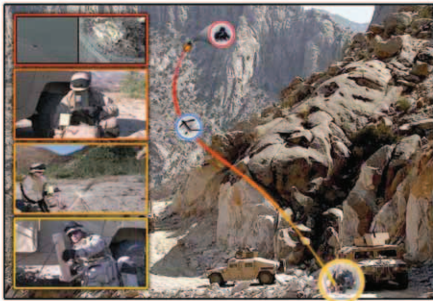
Figure 6: Small organic precision munitions

This effort demonstrates critical technologies for a 5-7lb Soldier-carried, guided, non-line-of-sight munition. The critical technologies demonstrated will improve target acquisition, increase lethality against soft targets, provide a secure data-link, and increase battery life. This technology will provide forward operating bases with improved situational awareness, lethality, and survivability against combatants on ridgelines or overhangs, snipers in close urban terrain, and insurgents placing improvised explosive devices, while reducing collateral damage/fratricide.