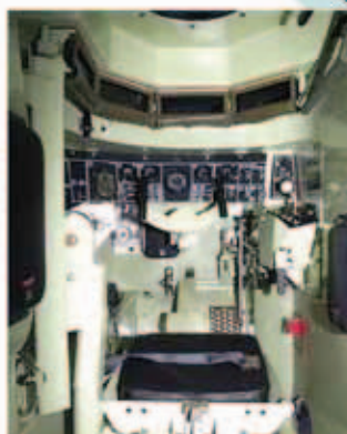
Driver's Station Bradley Fighting Vehicle