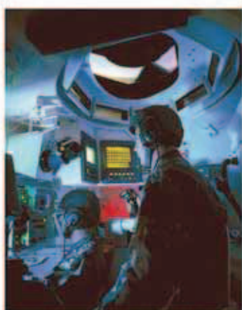
Commander's Station Abrams Tank