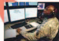
After Action Review