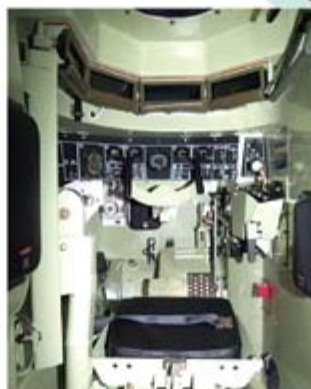
Driver's Station Bradley Fighting Vehicle