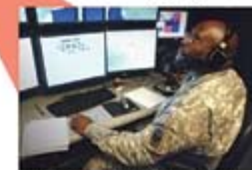
After Action Review