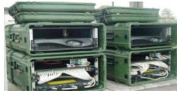
Battalion Command Post Node