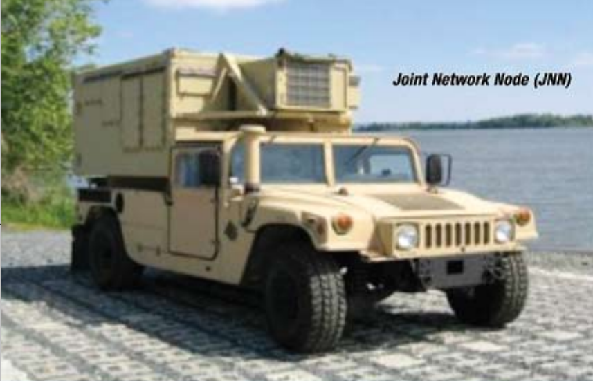
Joint Network Node (JNN)

Engineering Solutions and Products (ESP) (Eatontown, NJ) SRC (Shrewsbury, NJ)