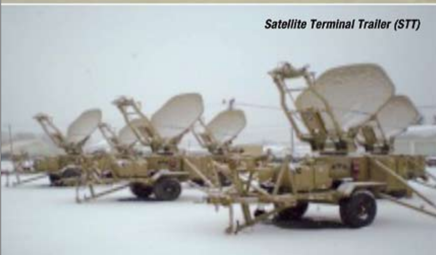
Satellite Terminal Trailer (STT)