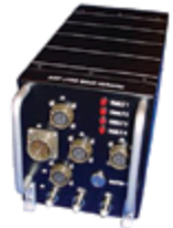
Small Airborne (SA)