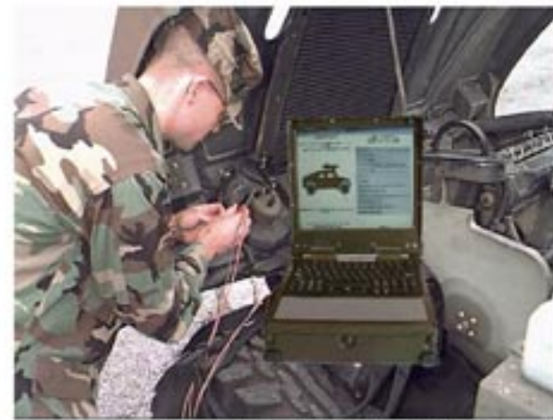
Maintenance Support Device

Enables verification of Army weapon systems and components, or the isolation, diagnosis, and repair of faults through mobile, general purpose, and automatic test systems.