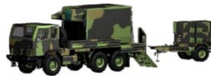
AN/TSM-191(V) 5 Electro-Optics Test Facility